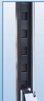
Internal ladder locking system