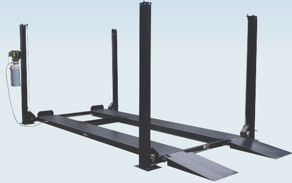
FP8K-DS Deluxe Series Storage / Service lift

Smooth operation and good looks make a great first impression but it's the safety features and durability that makes the "Deluxe Series" the best choice in storage/service lifts.